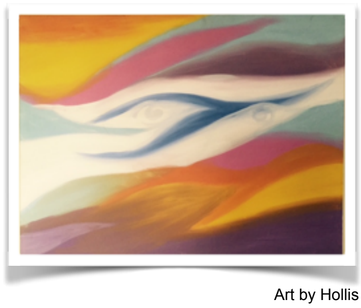
Art by Hollis